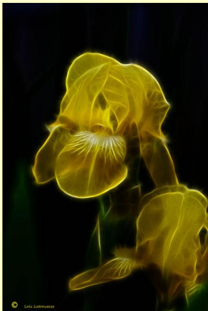
2010-11 Year-End Competition People's Choice – Print Yellow Iris Delicacy by Lois Latraverse