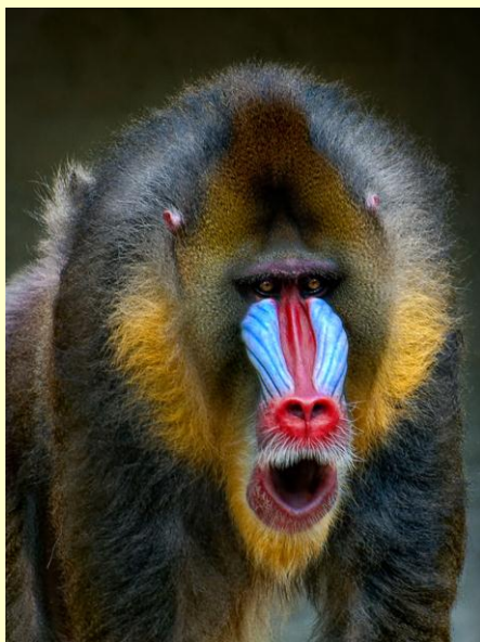
2010-11 Year-End Competition Best in Show – Print Mandrillus by Laura Vear

All print entries shall have a picture area that is a minimum of 5x 7 and no larger than 16 x 20. All entries must be matted and/or mounted. The maximum size of the presentation, including the matte or mount shall be no larger than 16x20.