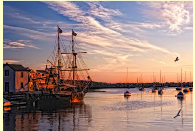
September First Place – Open Harbor Sunrise by Lois Latraverse