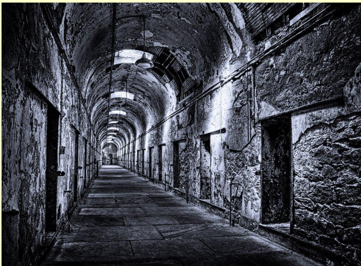
September First Place – Black & White Abandonment Issues by Laura Vear

Images must be sized so that they project correctly. The horizontal side or Width must be 1024 pixels or less. The vertical side or Height must be 768 pixels or less.