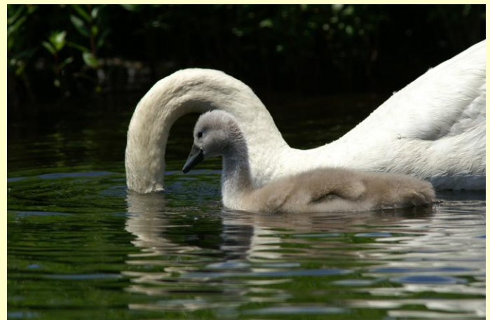
September First Place – Novice Cygnets by Melissa Grenier